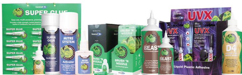
Part of the Bond It Glue Monster Range

The data presented in this leaflet are in accordance with the present state of our knowledge, but do not absolve the user from carefully checking all supplies immediately on receipt. We reserve the right to alter product constants within the scope of technical progress or new developments. The recommendations made in this leaflet should be checked by preliminary trials because of conditions during processing over which we have no control, especially where other companies raw materials are also being used. The recommendations do not absolve the user from the obligation of investigating the possibility of infringement of third parties rights and, if necessary clarifying the position. Recommendations for use do not constitute a warranty, either expressed or implied, of the fitness or suitability of the products for a particular purpose.